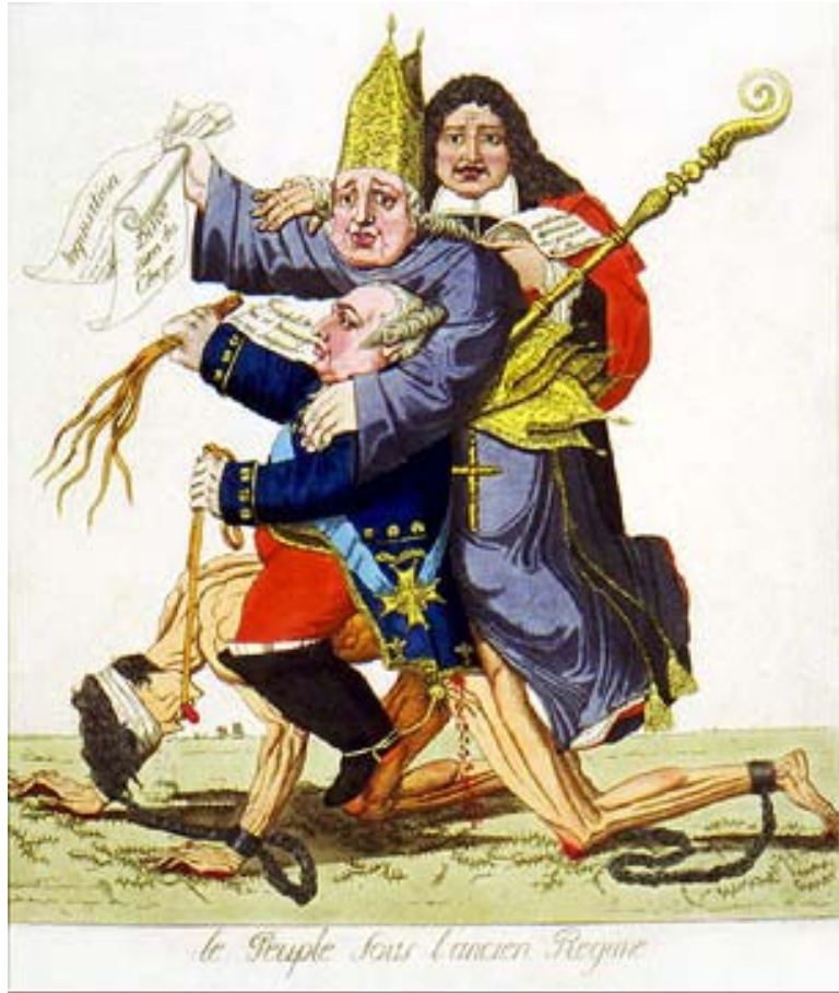
Image depicting the three estates during the Old Regime