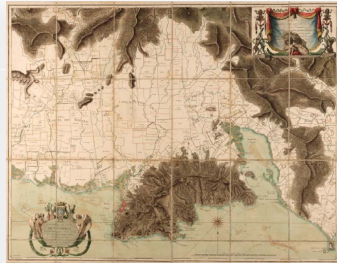
Title: Plan de la Plaine du Cap François en l'Isle St. Domingue, redigé d'après les derniers operations géométriques des ingénieurs du Roy ID Number: 2007.0247 Date: 1786 click here to see record