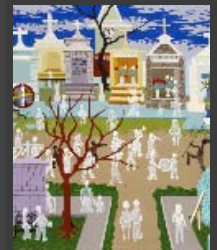
The Saints Going Marching In